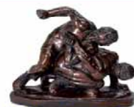
2nd Place 12 inch Trophy