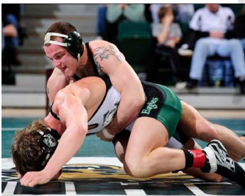
Purdue wins at 2012 MAC Tournament