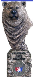
1ST Championship Gear Package

All Freestyle & Greco State Events Awards